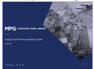
Supply Chain Planning